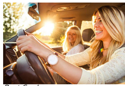
Best Car Loans

Get approved FAST. 99% of people who apply get accepted in minutes.