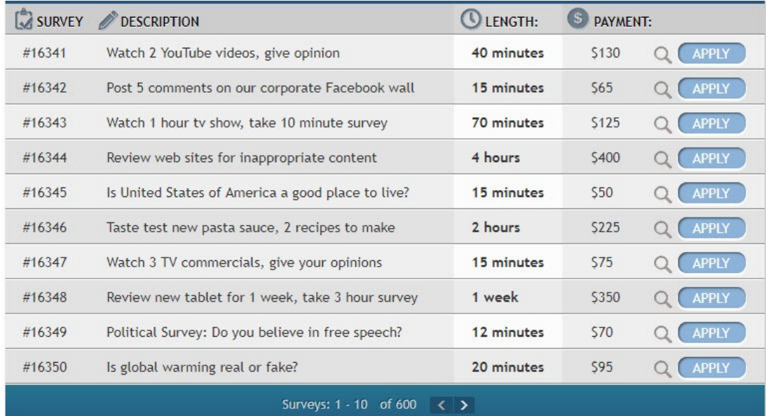
Top Paying Surveys

Many moms make extra money (sometimes hundreds or even an entire monthly wage) just by answering surveys and polls.