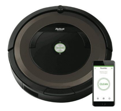
Free iRobot Roomba Vacuum

There are also some big survey sites which give free products and free gift cards in exchange for your opinion.