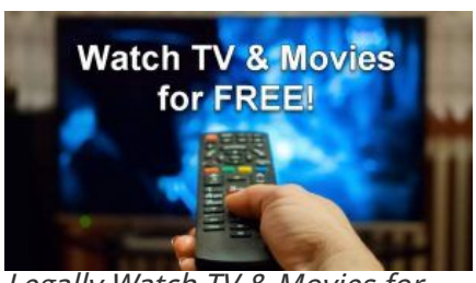
Legally Watch TV & Movies for Free

Check out this Special Antenna device that captures cable network signals so you can legally watch a ton of programs for FREE without